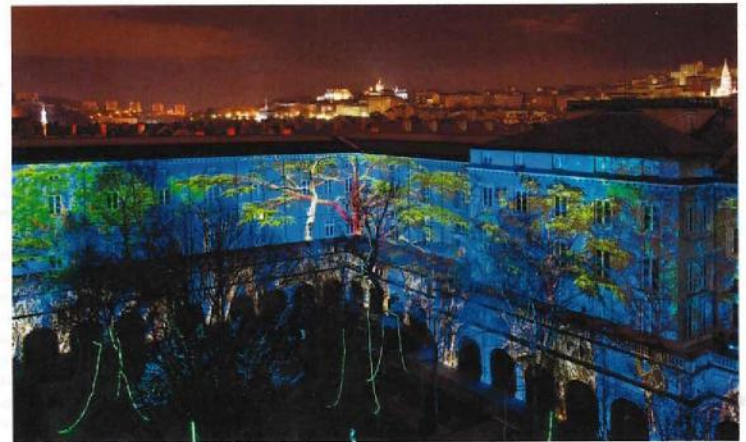
Fête des Lumières de Lyon 2010 - Jungle Urbaine / DEP