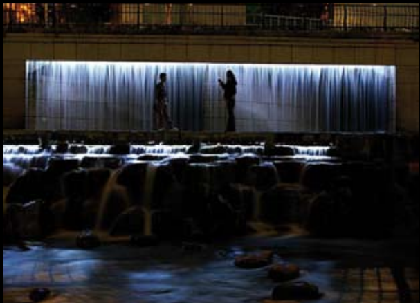
Seoul - 1 st prize city.people.light award 2008

With the international city.people.light award, Philips and LUCI wish to reward towns or cities that are attempting to rehumanize the urban environment through the medium of light and exploring ways to maximize energy efficiency, minimize the use of hazardous substances and reduce waste. Created in 2003, this competition is a joint initiative between Philips and LUCI.