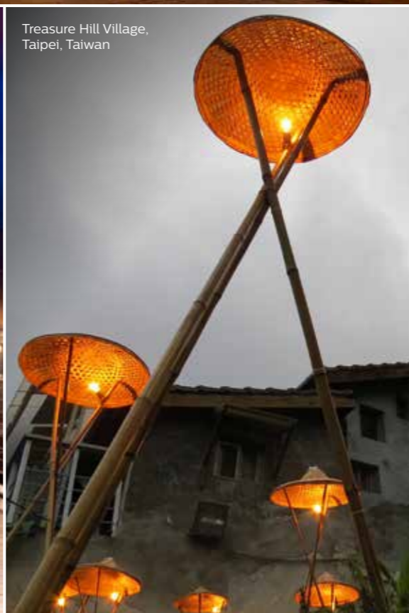
Treasure Hill Village, Taipei, Taiwan