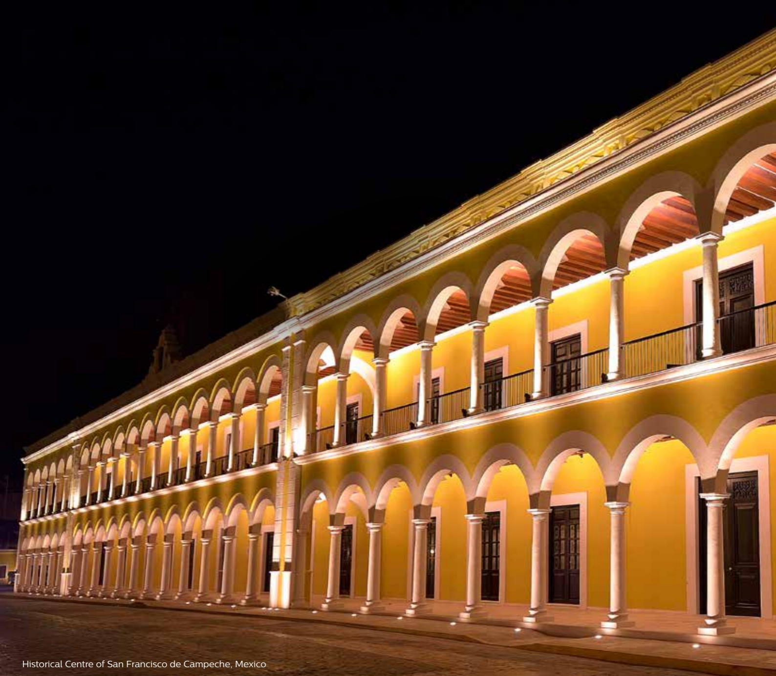
Historical Centre of San Francisco de Campeche, Mexico