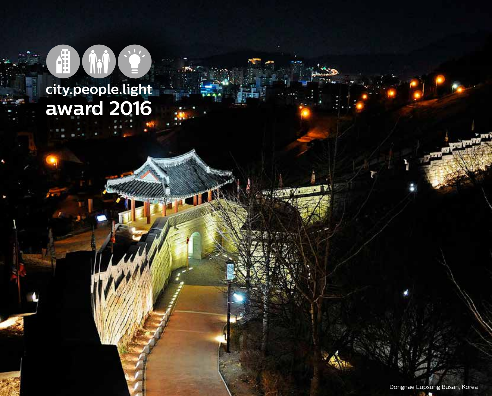
Dongnae Eupsung Busan, Korea